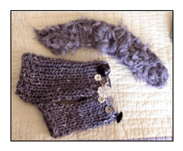
Above, sweater with detachable "fur" collar and seed stitch hem (for a boy)