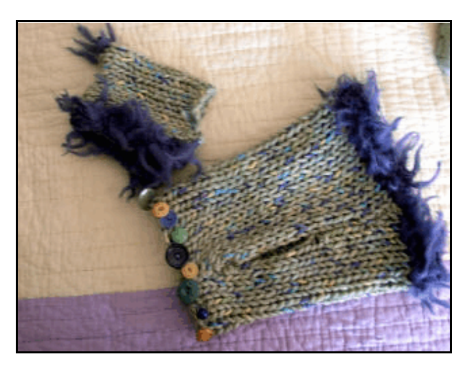
Above and right, sweater with detachable hood and faux fur hem (for a girl)